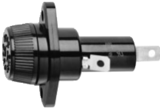
Dimensional Data All dimensions ( \pm 0.015 )